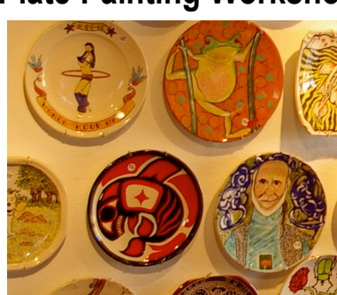
Plate Painting Workshop, Saturdays in February, 12-4pm

The 17th annual Plate Project kicks off in February with Saturday workshops led by our most experienced plate painters. Join us in the warm and sunny gallery to learn new and best techniques for successful plate-painting. All artists, community members and art students welcome. Bring someone new! Plate Project is a great way to discover and encourage new talent!