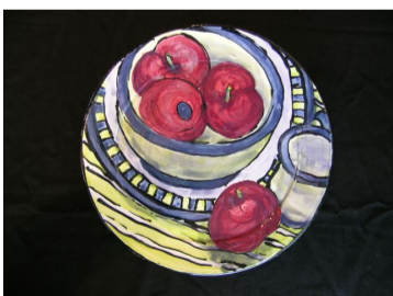
Plate Painting begins in February!