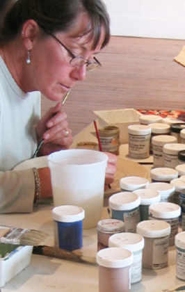
Plate Painting Workshops, Saturdays in March, 12-4pm

Applications may be sent by mail or email to 106 W Bunnell Ste A, Homer, Alaska 99603 or info@bunnellstreetgallery.org (Please type ALEX COMBS ARTIST AWARD in the subject line)